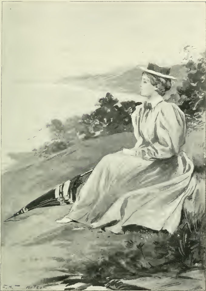
She would sit for hours with no companion save her thoughts.— Page 215